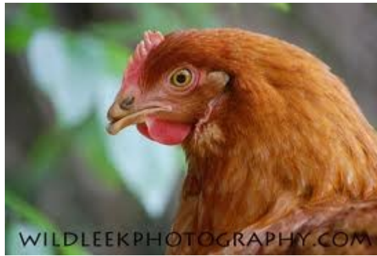
Properly debeaked bird